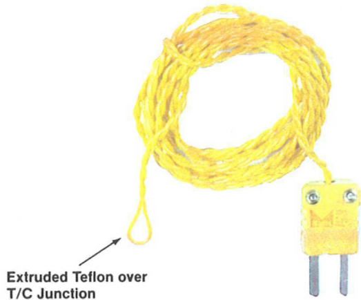
M990 — Thermocouple Type K $28.00 ea.

Very fine gage (40 ga. -.003") Type K thermocouple. This teflon insulated exposed junction thermocouple is 36" long and has a Marlin miniature plug (1260-K) attached. The junction can be cemented or taped in place. Temperature range to 400° F. Available only in Type K.